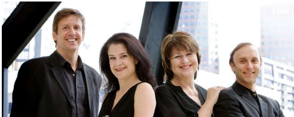
Goldner String Quartet