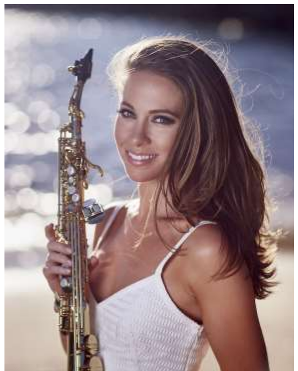
Saxophonist Amy Dickson

11:30pm – 2pm FESTIVAL CONCERT #5 2:30pm – 3:15pm AYO Chamber Players Concert 5 3:45pm – 4:15pm Artists in Conversation 3 4:30pm – 7pm FESTIVAL CONCERT #6 7pm – 8pm Meet & Mingle - Festival closing